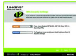
WPA Pre-Shared Key

On the Confirmation screen, make sure your settings are correct. Click Next to save your new settings.